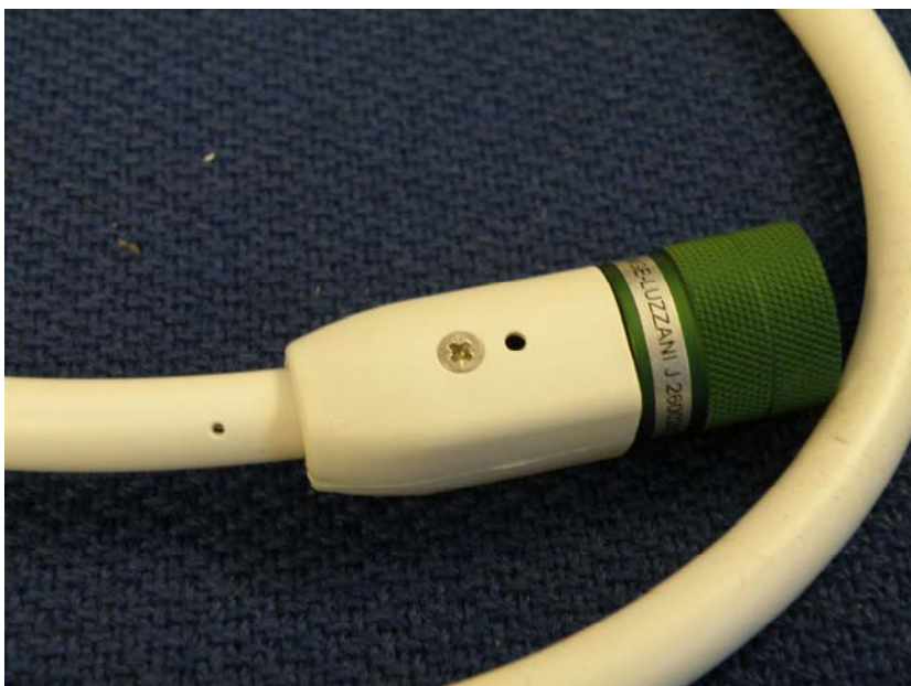
Picture 3. It is important that the hole is round to prevent hose from splitting.